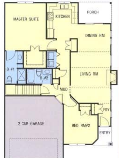
Alternate Exterior Unit